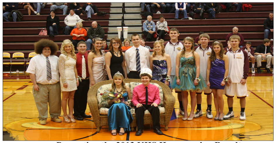
Presenting the 2013 KHS Homecoming Royalty

Friday, April 19 - 7:30 PM Saturday, April 20 - 7:30 PM Sunday, April 21 - 2:00 PM